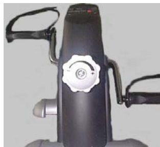
Large Resistance Dial

Model: EZC-6 Sturdy 2" steel frame 5 function LED display (time, speed, distance, calories, scan) Adjustable band resistance 2KG Flywheel with smooth action Contoured pedals with non-slip strap Set-up size: 11" tall, 18" long, 12" wide N.W. 15 lb. G.W. 17 lb. 1-Year Warranty